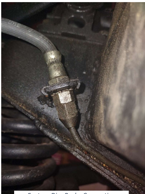
Factory Disc Brake Connection