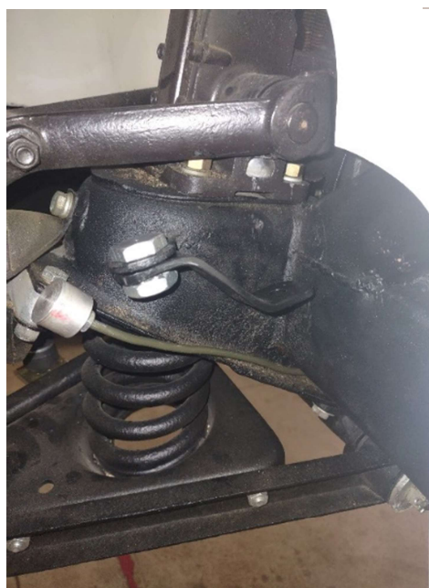
Factory Drum Brake w/ Bracket