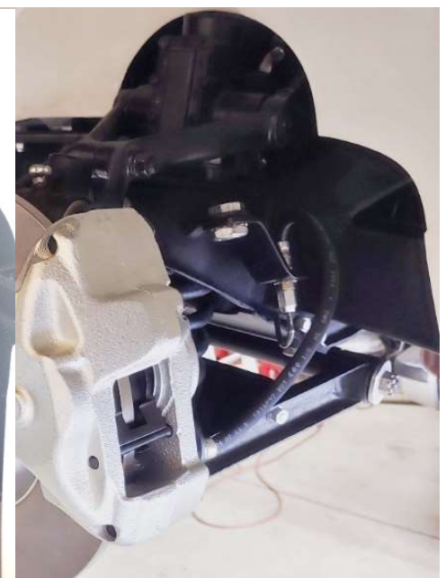
Disc Brake Conversion Complete